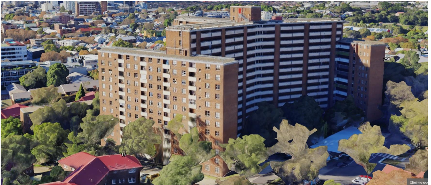
JOHN NORTHCOTT BUILDING